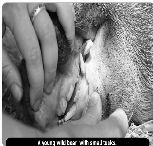
A young wild boar with small tusks.