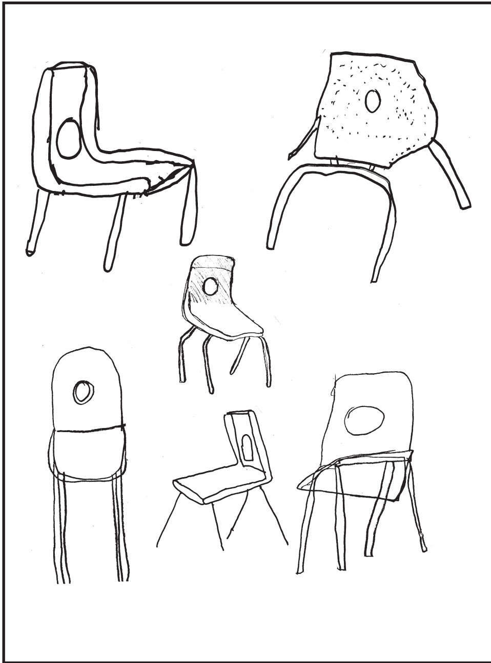
Examples of drawings where children have drawn the seat of a chair when they could not actually see the seat. They knew it must be there, so they drew it